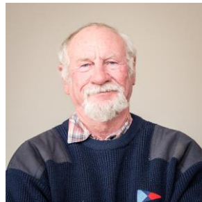
Noel Street 0409 024 903